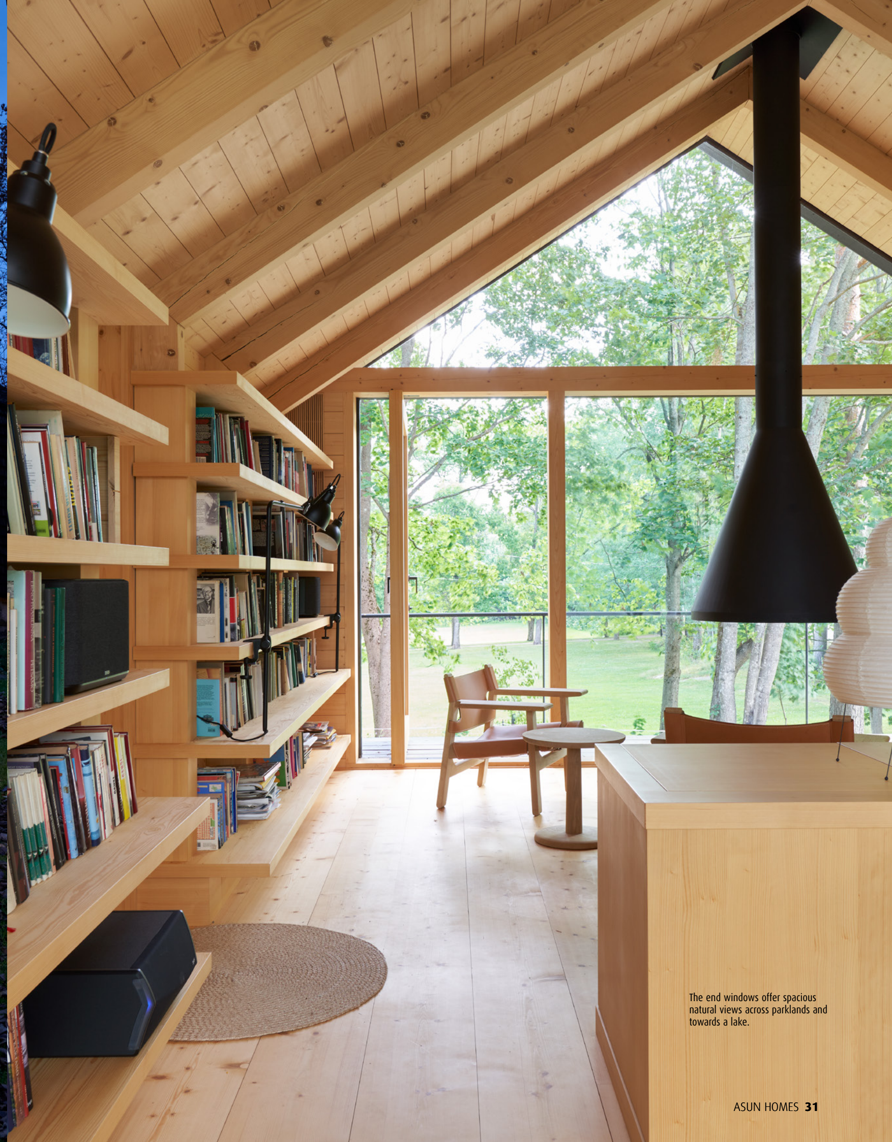
The end windows offer spacious natural views across parklands and towards a lake.