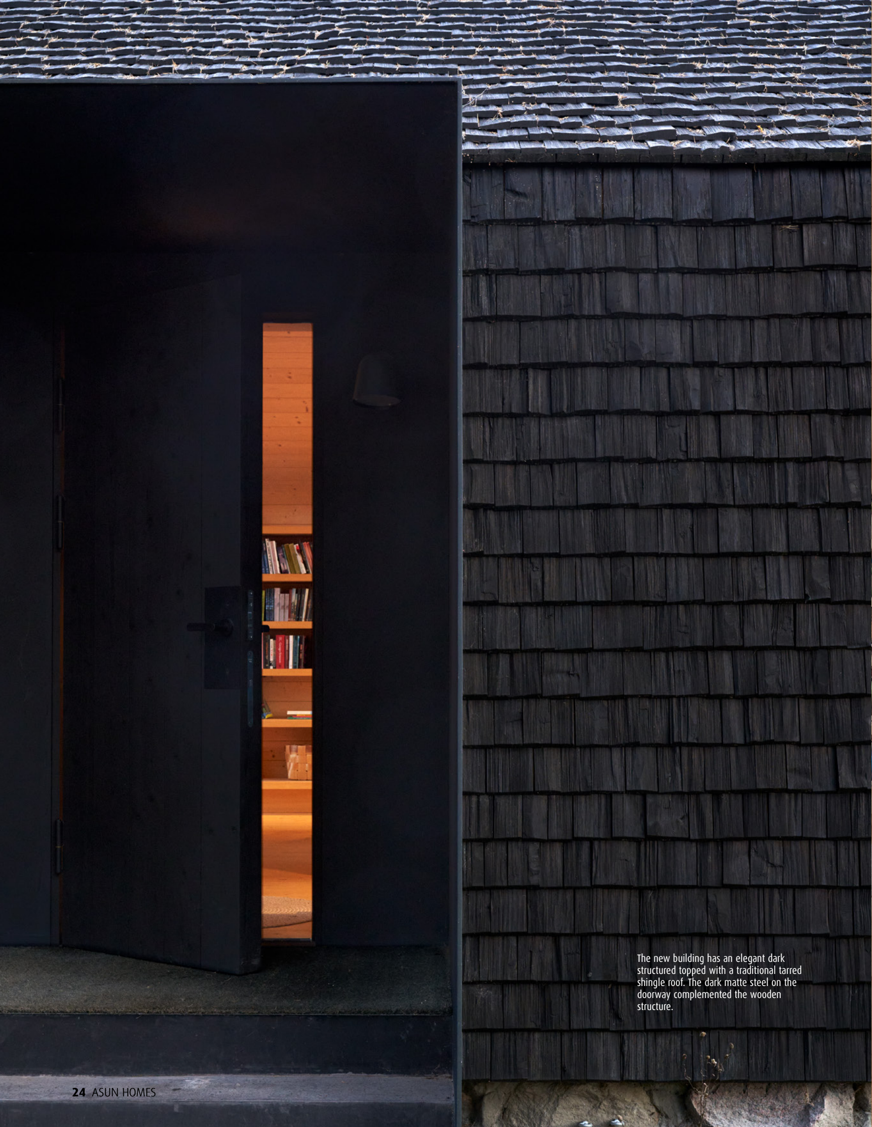
The new building has an elegant dark structured topped with a traditional tarred shingle roof. The dark matte steel on the doorway complemented the wooden structure.