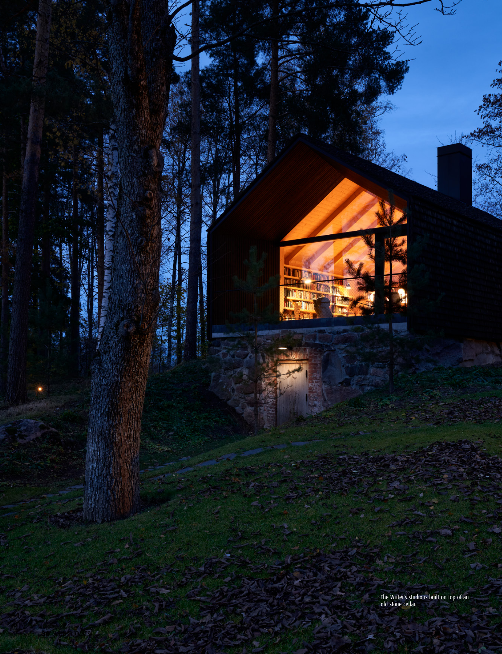
The Writer's studio is built on top of an old stone cellar.