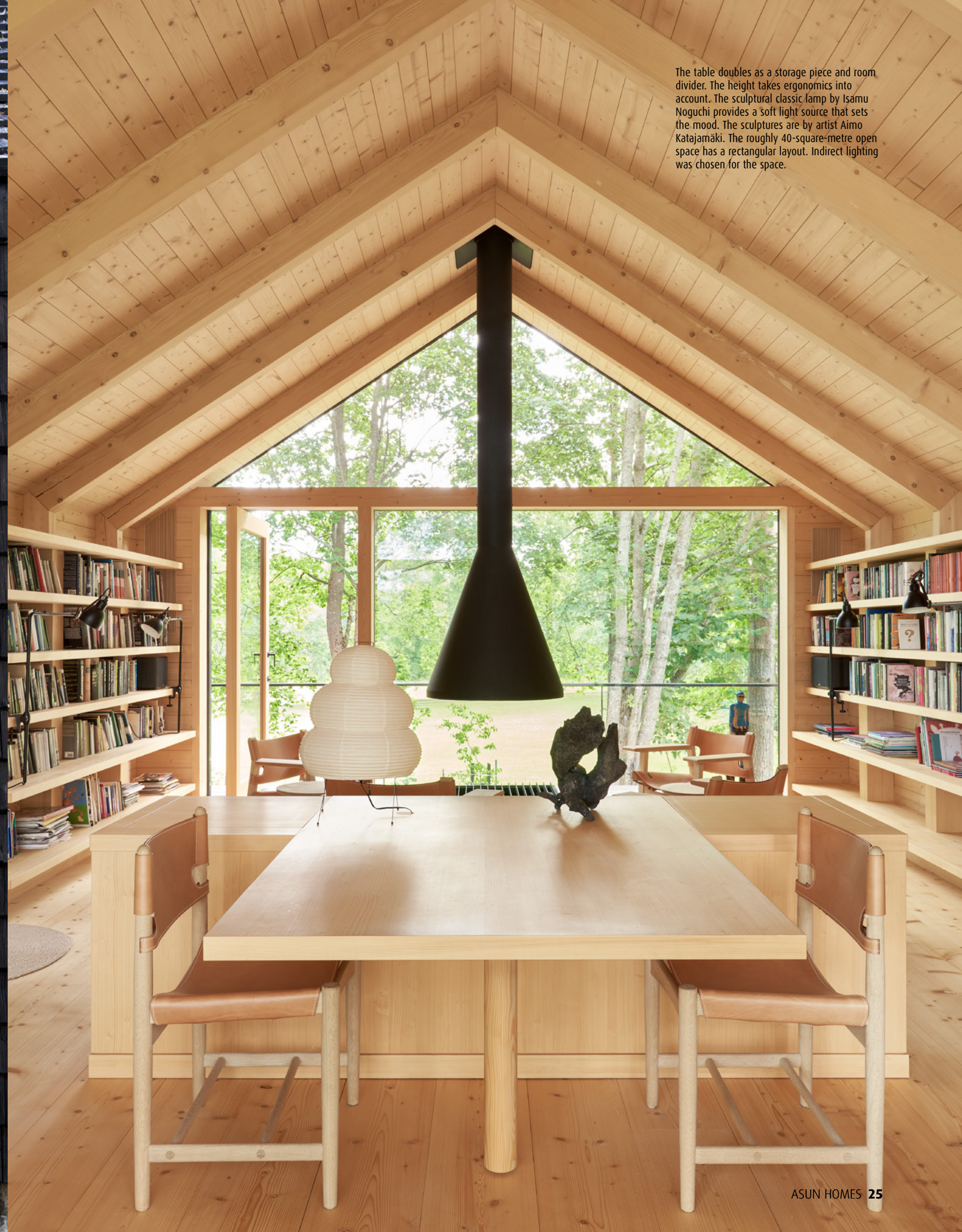
The table doubles as a storage piece and room divider. The height takes ergonomics into account. The sculptural classic lamp by Isamu Noguchi provides a soft light source that sets the mood. The sculptures are by artist Aimo Katajamäki. The roughly 40-square-metre open space has a rectangular layout. Indirect lighting was chosen for the space.